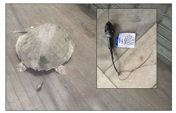
Fig. 1 Olive ridley turtle on deck of fishing vessel fitted with Wildlife Computers survivorship pop-up archival tag attached using a short tether to attach to the rear supracaudal scutes. Inset: survivorship tag

sPAT tags have been used to determine post-bycatch survivorship in several elasmobranchs including mako sharks (Isurus oxyrinchus, [26]), silky sharks (Carcharhinus falciformis, [27]), school sharks (Galeorhinus galeus, [28]), great hammerheads (Sphyrna mokarran, [29]) and spinetail devil rays (Mobula japonica, [30]) but application to air-breathing marine species subject to decompression sickness, such as sea turtles has been limited, though satellite tags have been used to infer survivorship but using more limited data (e.g., [19, 24]). Here, we deployed sPAT tags to determine survivorship of olive ridley sea turtles (Lepidochelys olivacea) captured in demersal fish trawling vessels in Gabon, Africa. Gabon regularly hosts four sea turtle species, including leatherback (Dermochelys coriacea), green (Chelonia mydas), hawksbill (Eretmochelys imbricata) and olive ridley sea turtles [31-35]. Many of these species are caught in trawling nets; however, olive ridleys are caught in disproportionately large numbers compared to the number of individuals in the local population [36], making trawling of particular concern. We illustrate attachment design and procedure, and results of the deployment of three sPAT tags in pilot study conducted in 2016. We discuss